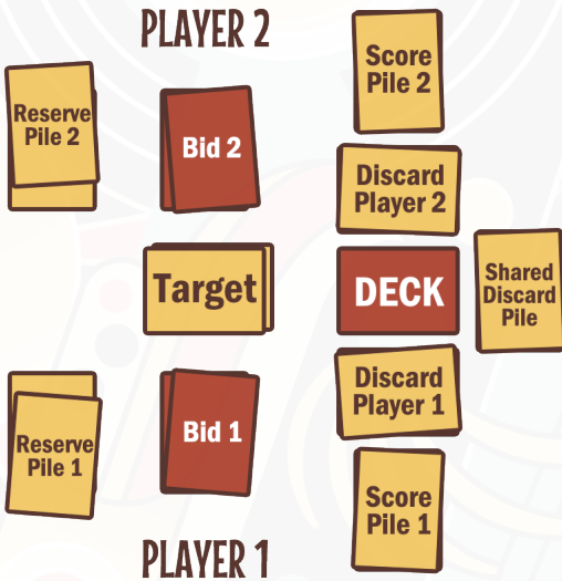
Table Layout: Below is a diagram showing all the positions on the table. Each player has their own discard pile, as well as a pile of “reserves” that will return to their hand. There is also a shared discard pile, for cards that are no longer needed.

Setup: Shuffle the deck and deal a hand of 8 cards to each player.